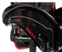
NSW040104 Carbon fibre, cold weather protection, fender