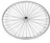
NSW070002 Design wheel