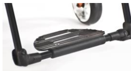
NSW050059 Footboard platform, Performance