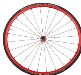
NSW100338 Lightweight wheel, anodized red