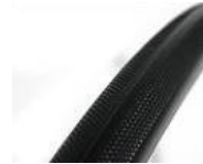
NSW070102 Tyre, puncture proof