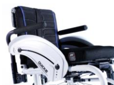
NSW040117 Tubular armrest, swing away, removable, padded