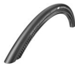
NSW070107 Schwalbe One