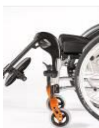
NSW050011 Hanger, aluminum, flip-up (0- 90°, Swing-away