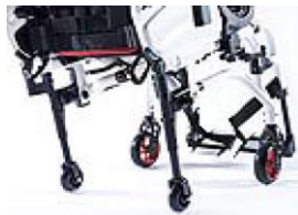
NSW090010 Transit wheels