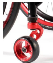
NSW080008 Castor fork, aluminum, one-arm, red