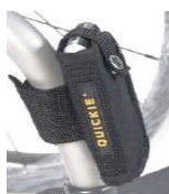
NSW090026 Mobile phone pocket