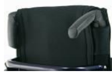
NSW030203 Push handles, fold-down