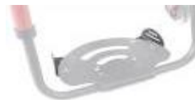
NSW050127 Adjustable side protection