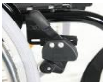
NSW060002 Knee lever brake