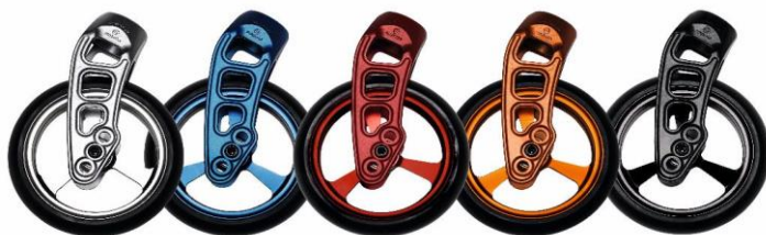
NSW080013 & NSW080306 Castor fork, Carbotecture & Castor solid (soft) aluminum