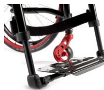
NSW050132 Footboard platform, lightweight, carbon fibre