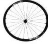
NSW070004 Proton wheel