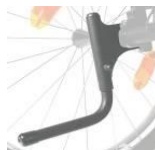
NSW090001 Tip assist