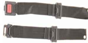
NSW090018 Lap belt with buckle, metal