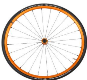
NSW100336 Lightweight wheel, anodized orange