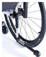
NSW090006 Anti-tip tubes, swing away