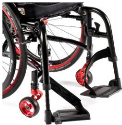
NSW050022 Footboard divided, aluminium, frame colour