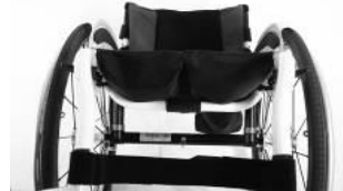
NSW020003 Seat sling with 2 utility bags