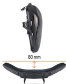
JAY J3 Back Mid Contour