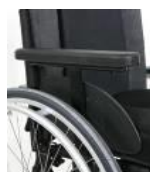
NSW040052 Single-post sideguard, armpad (330 mm)