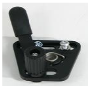
NSW060001 Standard brake