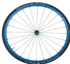
NSW100337 Lightweight wheel, anodized blue