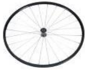
NSW070003 Lightweight wheel