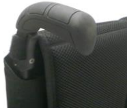
NSW030201 Push handles long