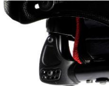
NSW030012 Backrest, angle adjustable